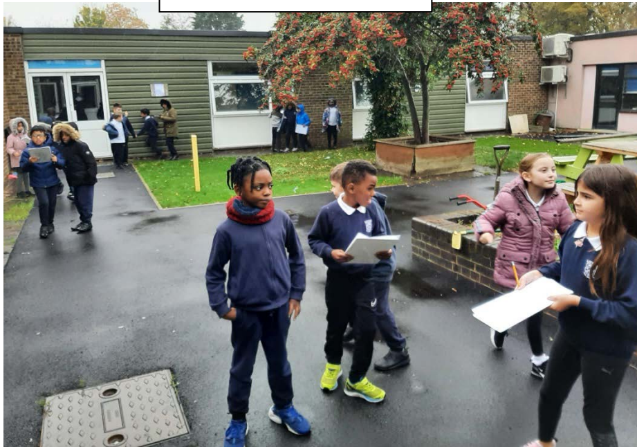
Year 3 orienteering in teams

As always, please continue to encourage your children to complete all their homework including their daily Home Reader to ensure they continue to make progress.