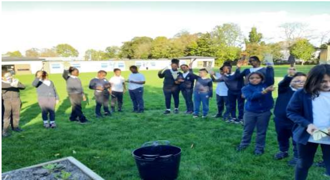
Later on, they replanted the seedlings from their cups to the main plant bed.