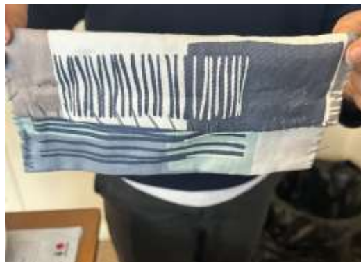
Kians pocket purse

As part of our topic we have been sewing with children producing some amazing work. Kian in 5B made a very well made purse with lovely neat stitching.