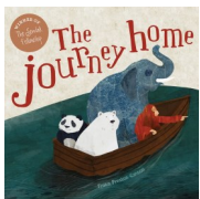
The Journey Home