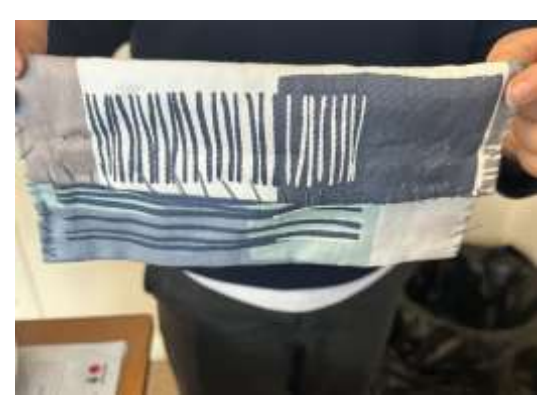
Kians pocket purse

As part of our topic we have been sewing with children producing some amazing work. Kian in 5B made a very well made purse with lovely neat stitching.